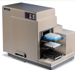
Plate type: 384-well plate Readouts: Fluorescence, luminescence Applications: HTS, kinetic assays, multiplexing