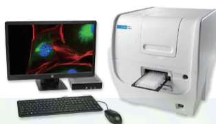
Plate type: 96-well plate Readouts: Fluorescence, luminescence, absorbance, FP, TRF, TR-FRET, HTRF Applications: Fluorescence, luminescence, absorbance